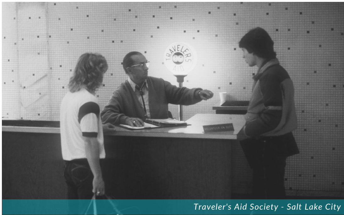
Traveler's Aid Society - Salt Lake City

Since 1923, The Road Home has served as a cornerstone of Salt Lake County's community. Originally established as the Travelers Aid Society to help stranded travelers, over the years our agency has